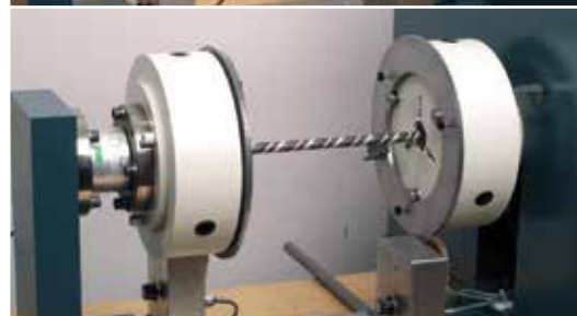
Top to bottom: A test in progress on the 10,000in.lbf model with a painted sample rod of steel.