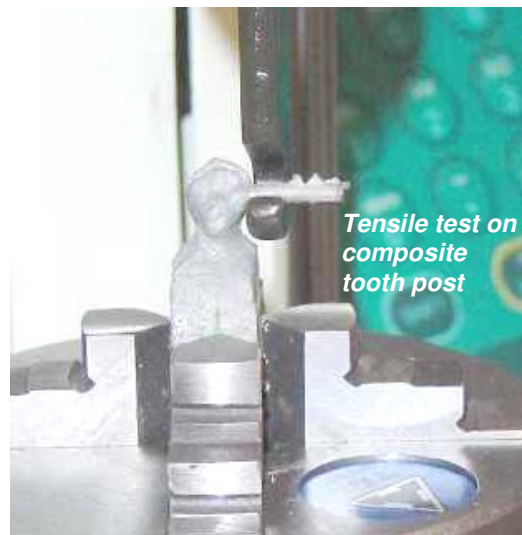
Tensile test on composite tooth post