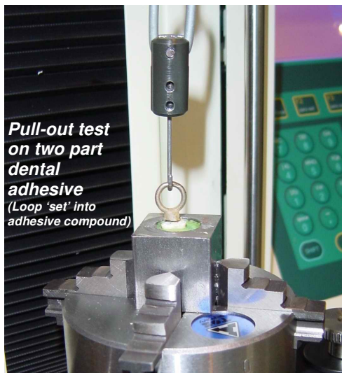
Pull-out test on two part dental adhesive (Loop 'set' into adhesive compound)