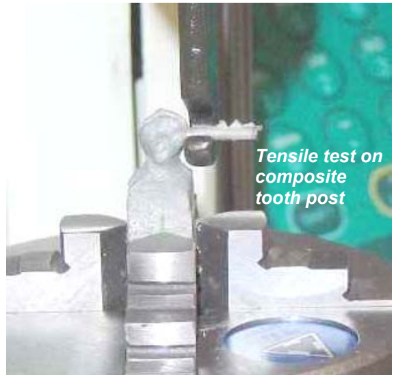
Tensile test on composite tooth post