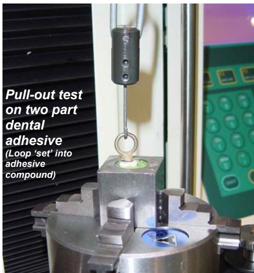
Pull-out test on two part dental adhesive (Loop 'set' into adhesive compound)