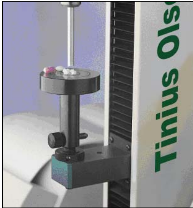
Tinius Olsen Compression Test For Tablets