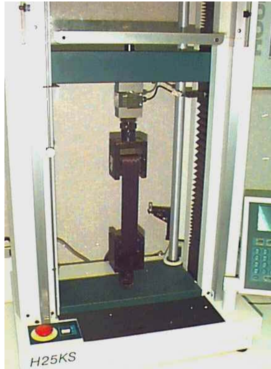
View of HT43 grips assembled with belt specimen and ready for test on H25KS machine