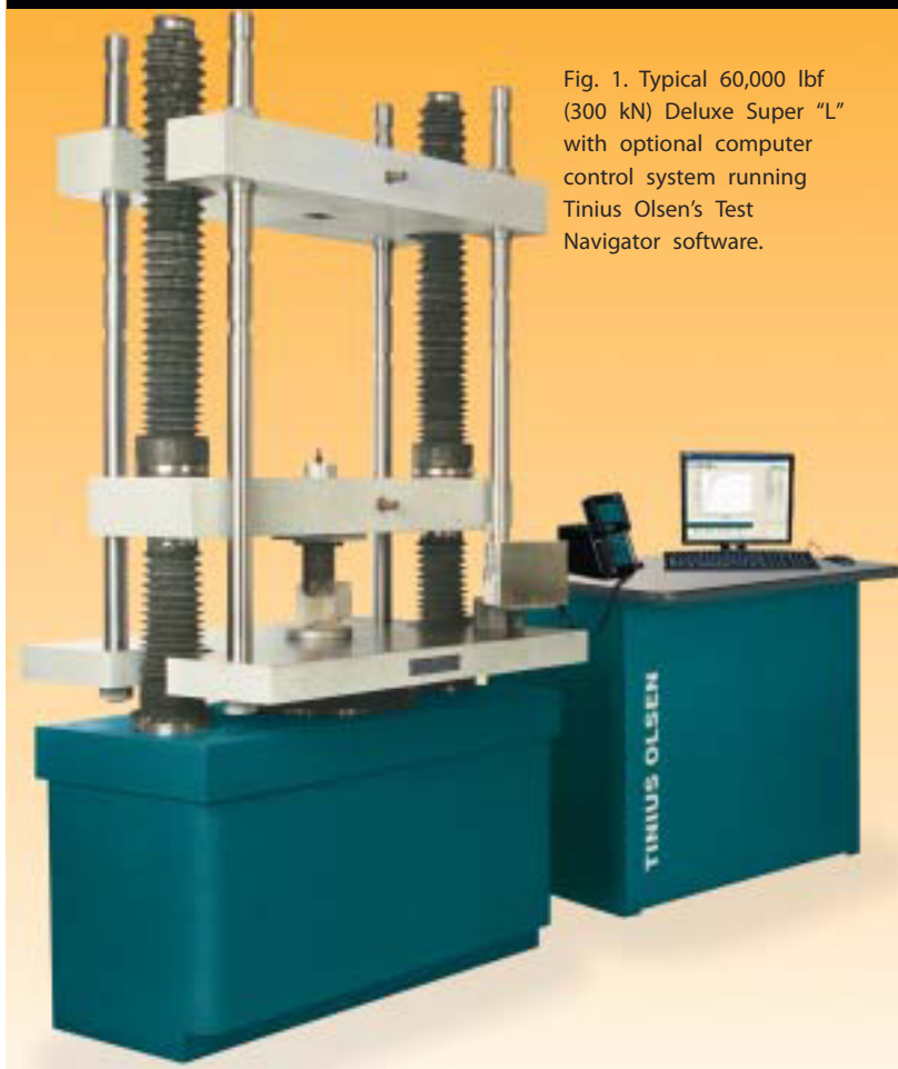
Fig. 1. Typical 60,000 lbf (300 kN) Deluxe Super "L" with optional computer control system running Tinius Olsen's Test Navigator software.

Deluxe Super "L" machines have extra-large testing clearances and include an adjustable upper cross-head. They are available in 60,000 lbf (300kN) versions only. These machines have closed crossheads with crank operation of rack and pinion grips and a solid compression plate as standard. Grips are optional.